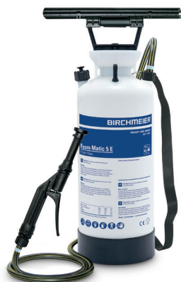
Foam-Matic 5 E