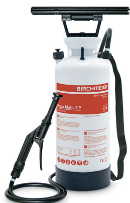
Foam-Matic 5 P