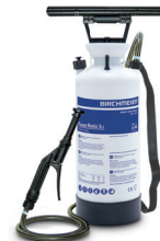
Foam-Matic 5 E (Blue = Alkaline foaming agents) Art.No. 11907601